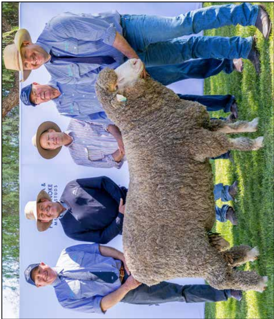
Poll Boonoke PB190678 was sold in 2020 to Haddon Rig for $75,000. He was sired by Willandra 170018 'Impact' Willandra 'Impact' is ranked in the top 5% for the MERINOSELECT MP+ and DP+ Indexes. Top 5% for YWT (93% acc) HCFW (84% acc) and ACFW (81% acc).