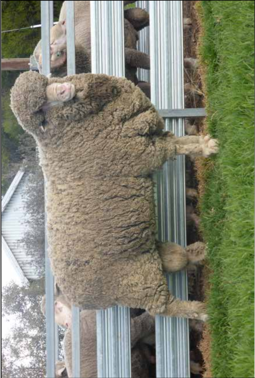
Old Rams are often ugly and 160001 is no exception. His ASBV's rank him top 5% for DP+, and MP+ Indexes. He is in the 1-2% percentile for YCFW (90% accuracy). He is a trait leader in the Merino Lifetime Project, Trangie, all 4 indexes, HCFW and HEMD. He is the sire of 180080