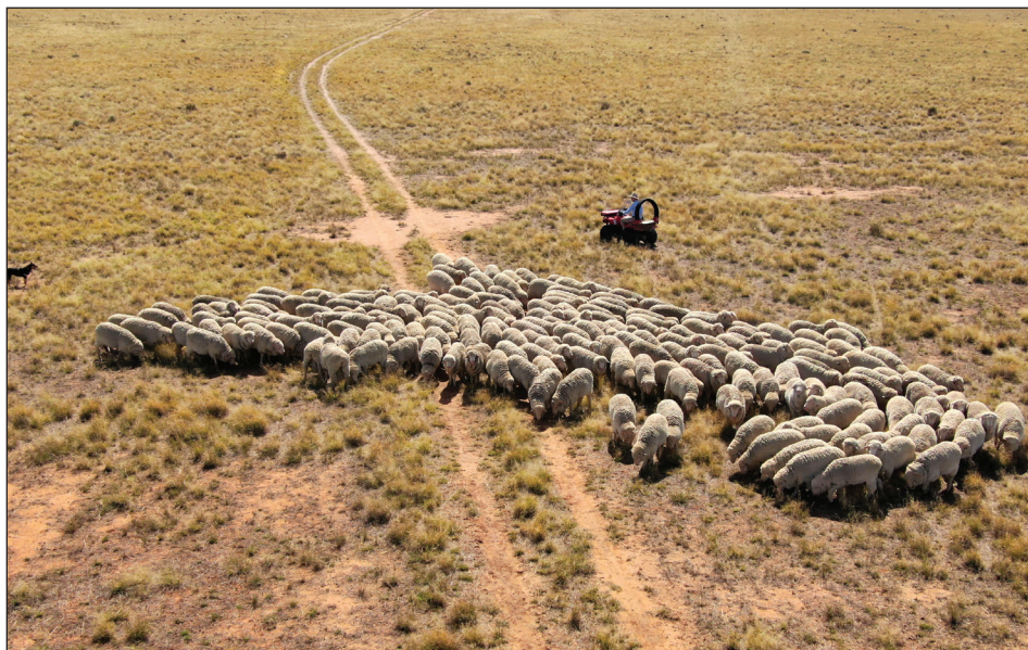
Bringing ram weaners home for shearing.