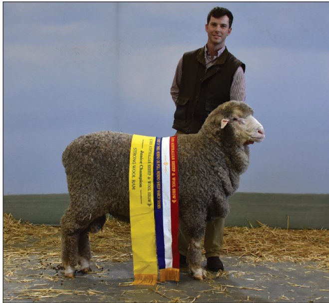
WIL220059 an embryo bred sire with a blue blood pedigree on both sides. His sire WILLANDRA IMPACT has been successfully used by a number of studs across Australia and has sired many top priced On-Property rams. Semen is available from this exciting new young sire.